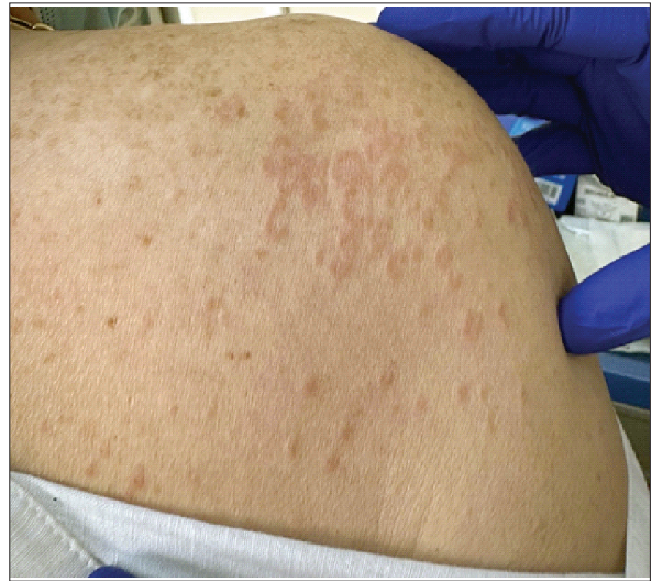
Figure 1. Multiple erythematous papules and annular plaques on the right shoulder (image from our clinic)

To confirm the diagnosis, we performed two punch biopsies from the posterior trunk and histopathological examination revealed granulomas characterized by histiocytes arranged in a palisading pattern around areas of necrobiotic collagen with mucin deposition (Fig. 3).