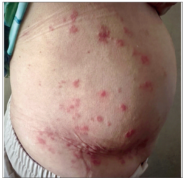
Figure 2. Erythematous plaques with elevated margins located on the anterior trunk (image from our clinic).

In the case we are presenting, following a paradoxically unsuccessful cryotherapy session with liquid nitrogen, the patient was started on treatment with hydroxychloroquine and topical calcineurin inhibitors, resulting in mild improvement of the lesions.