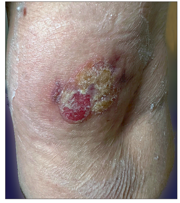
Fig. 2 - Erythematous scaly plaque with an ulceration on the side, after sutures removal

Following the corroboration of the clinical, dermoscopic, and histopathological data, the diagnosis of certainty of Bowen's disease was